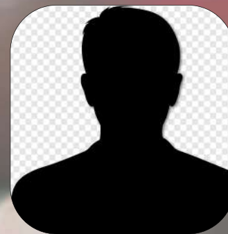
YOU WIL BE NEXT